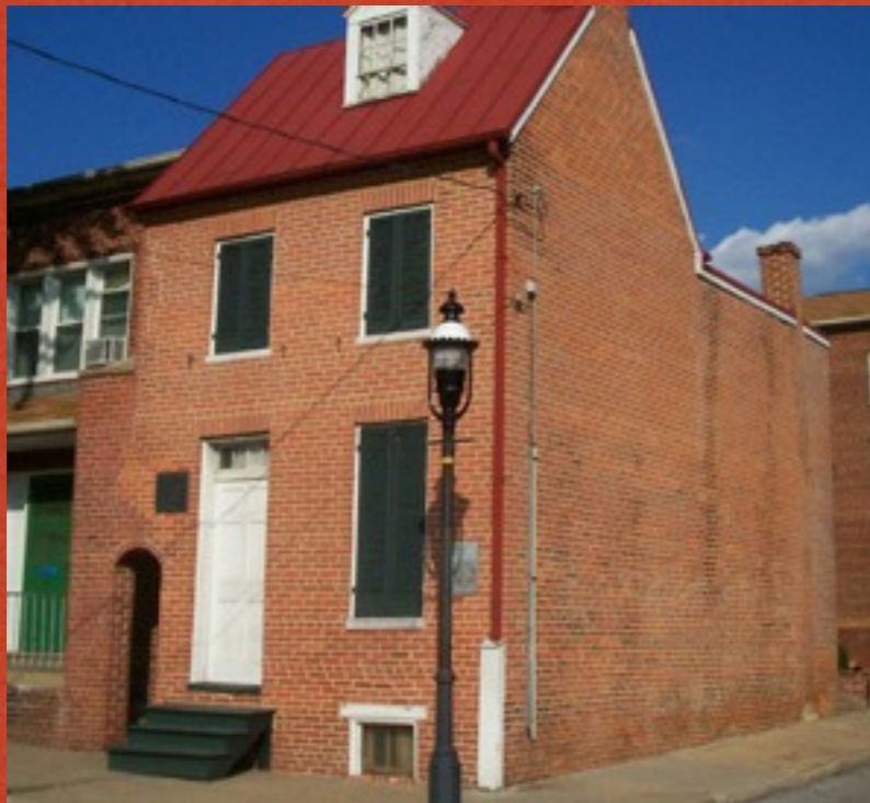
Edgar Allan Poe's house Baltimore, Maryland